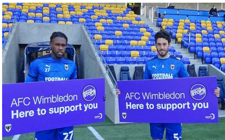
AFC Wimbledon have recently joined Merton's Hate Crime Third Party Reporting Scheme

For further info email: safes.merton@merton.gov.uk